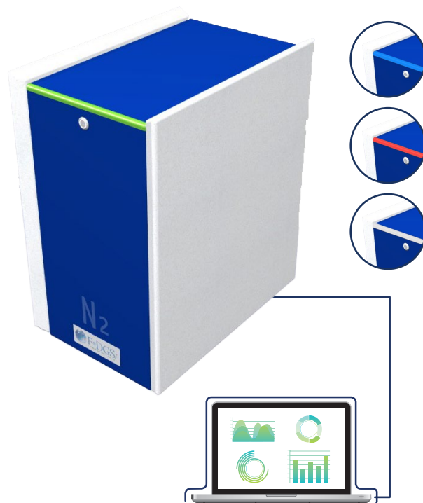
UNIQUE AND INTELLIGENT OPERATOR INTERFACE WITH REMOTE ACCESS

The COSMOS Nitrogen can be stacked to any COSMOS module (Hydrogen, Zero Air, Air Compressor) to give you a complete self contained GC gas solution.